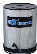
CK-500S Canister filter for 1-1/2HP~3HP dust collector.