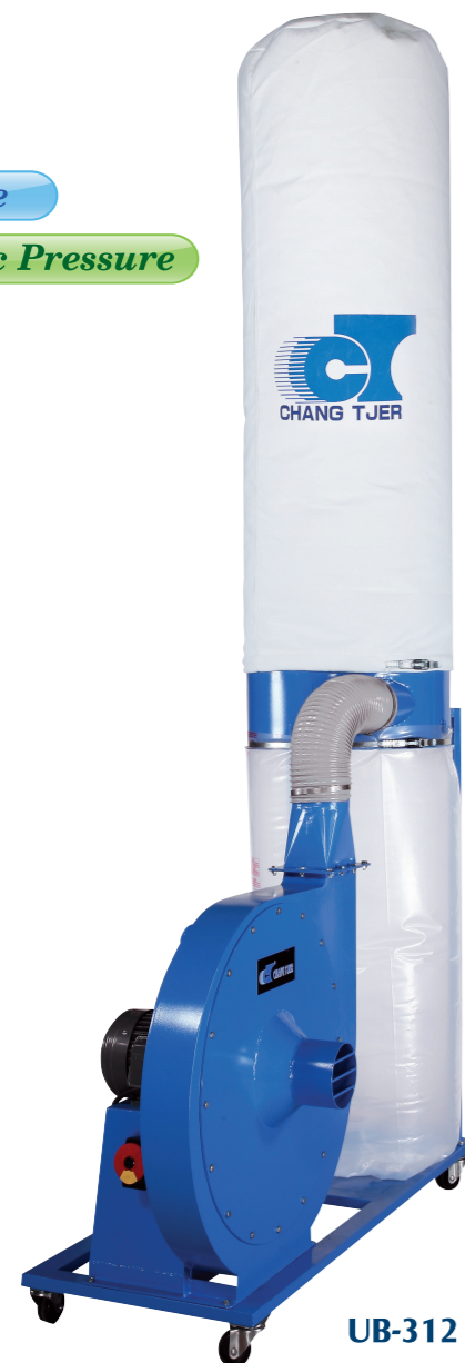
UB-312 / UB-313