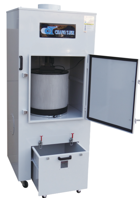
UB-503ECK / UB-505ECK

* Chang tjer reserves the right to change or modify specs and system appearance without notice. Actual system appearance may vary.