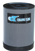
CK-500SH HEPA canister filter for 1-1/2HP~3HP dust collector.