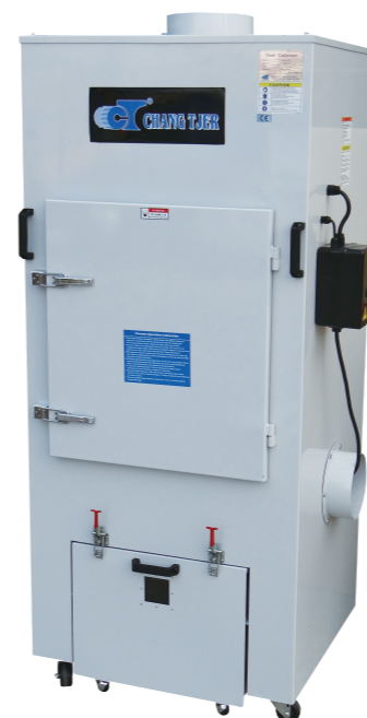
UB-503 / UB-505